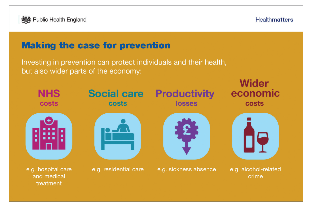
Figure 1: The benefits of investment in prevention

The very fact that the term 'investment' is widely used to refer to revenue spending on prevention is a clue in itself to the value of such spending. Most use of revenue in health is referred to as spending rather than investment: it represents the day-to-day running costs, the financial resources deployed to meet demand, or to deliver a project/programme. The term 'investment' suggests something different – the use of resources to gain future benefits, as in the case of using capital assets. This is the nature of preventative spend – it is indeed an investment, using resources now to gain future benefits, either by avoiding future financial costs (for example on acute care), reducing demand in the system, improving future financial sustainability or achieving greater health benefits from existing resources.