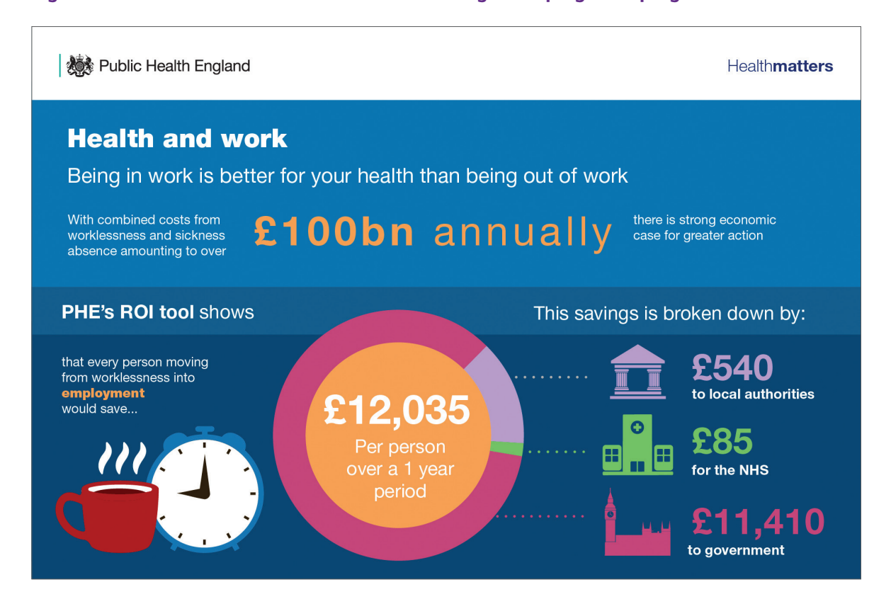
Figure 2: The return on investment from returning to employment programmes

The WHO report The Case for Investing in Public Health highlighted cost-effective interventions that provide a positive return on investment (ROI) and/or cost savings in either the short or longer term. The evidence shows that a wide range of preventive approaches are cost-effective, including interventions that address the environmental and social determinants of health, build resilience and promote healthy behaviours, as well as vaccination and screening. Some interventions show returns on investment within 1–2 years – for example healthy employment programmes, mental health promotion, and physical activity – while others are cost-effective in the longer term.