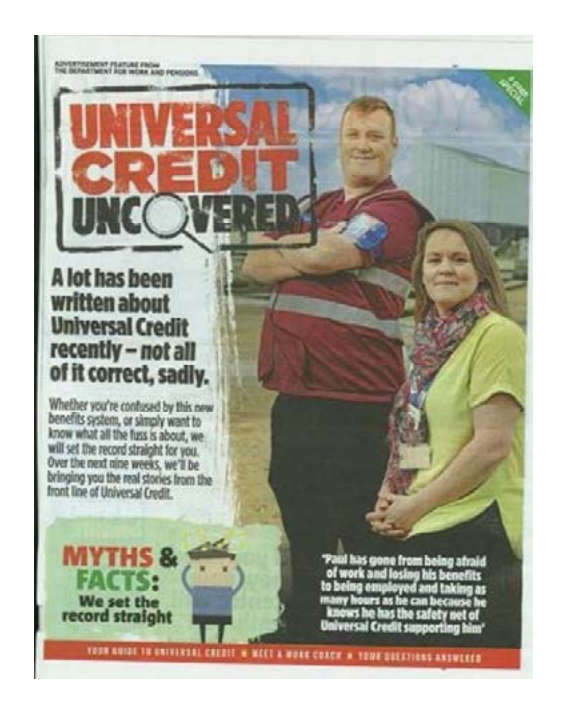
Figure 5: DWP's Universal Credit advertorial